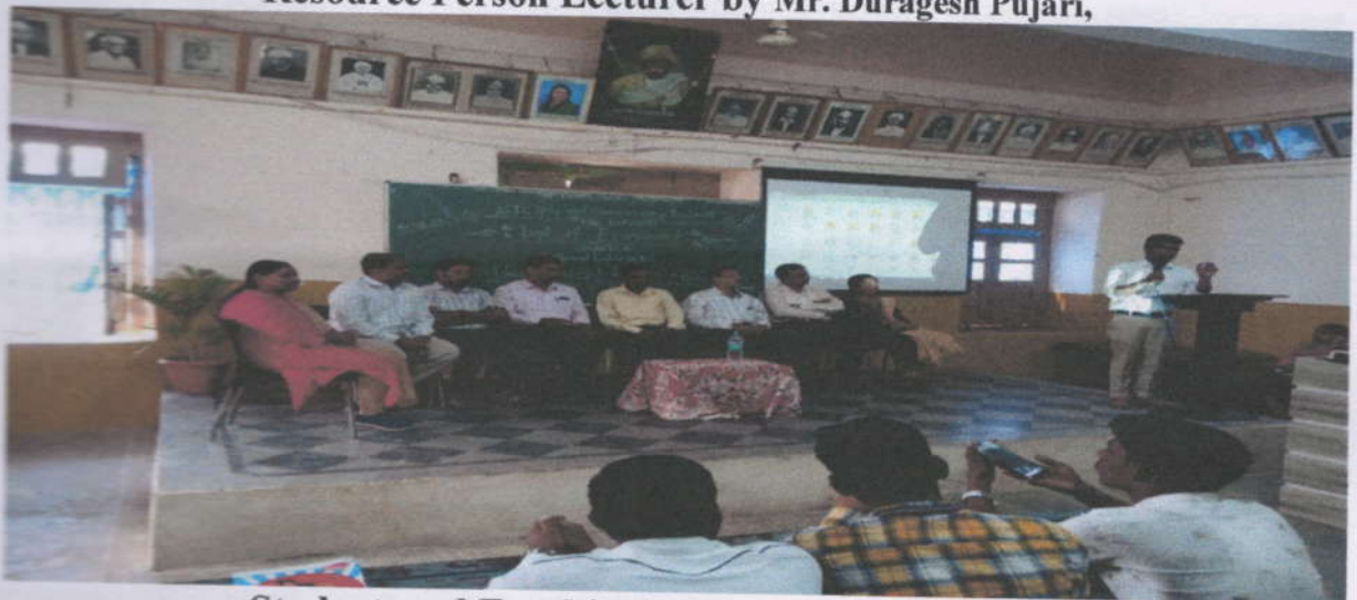
Student and Faculties Participated in Workshop